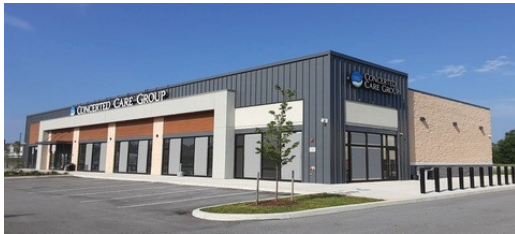
Gateway Medical Building